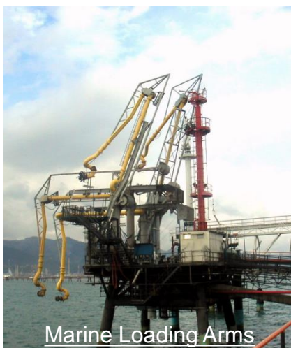
Marine Loading Arms