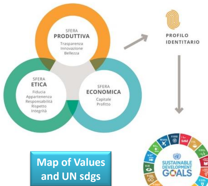
Map of Values and UN sdgs

are the elements of corporate cohesion and engines of the sense of corporate belonging. They are the prerequisite for optimizing people management, facilitate the dissemination and understanding of sustainability, support development and innovation, promote governance, in the unique context where values- sustainability—KPIs are coherent.